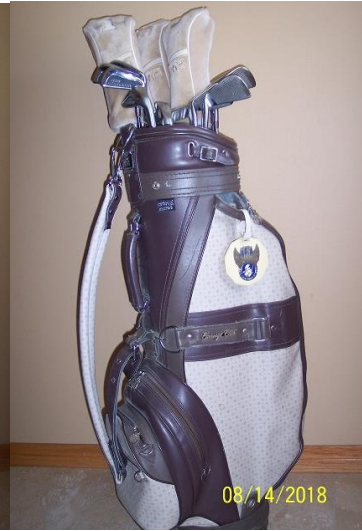
Men's golf set $25.00