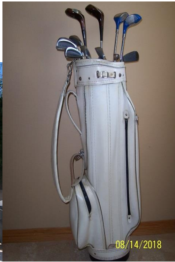
Ladies golf set $25.00