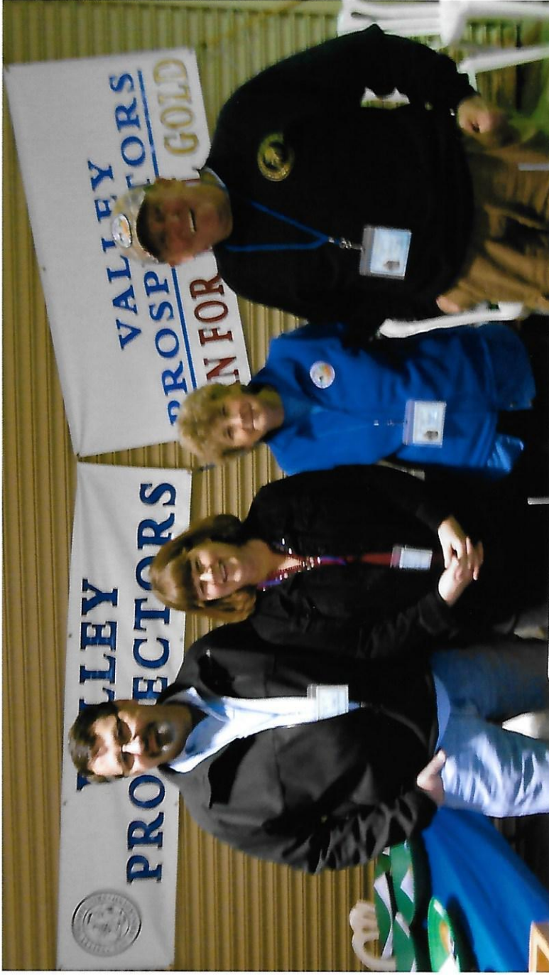
Ventura Gem Show