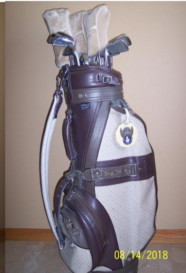
Men's golf set $25.00