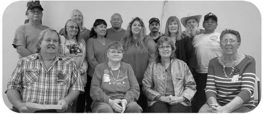
2023 Board of Directors

We are proud to introduce VP's team of newly elected officers and dedicated committee volunteers for the new year.