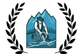
SHOWS & SCHOOLS

Since GPAA will not be holding its Gold Shows this year, Valley will plan to attend local shows. So far we plan to participate in Ventura, Lancaster, and Wrightwood. We also hope to hold a few school programs this year as well.