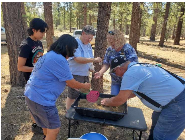
Club members sifting through their gem grab bags for treasure before the potluck. Three faceted peridot were hidden in a few lucky bags!

Once again competitors lined up for the gold pan toss game with a slight breeze adding an extra level of difficulty. It's harder than it looks! Later we all tested our mineral identification skills with a few rounds of lapidary bingo. Using a variety of beautiful stones to mark each spot. Early on in the weekend a few young guests learned how to do some drywashing and found their own Californian Gold, continuing the Club's proud history of encouraging prospecting as a family friendly hobby open to all who are willing to put in a few shovelfuls.