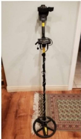
Whites MX Sport