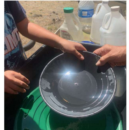
A young man gets his first look at color in his pan after drywashing and get together.