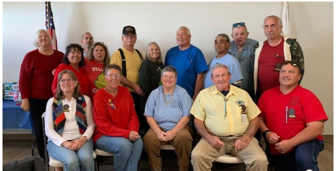
Above: The Newly Elected 2024 Valley Prospectors Board