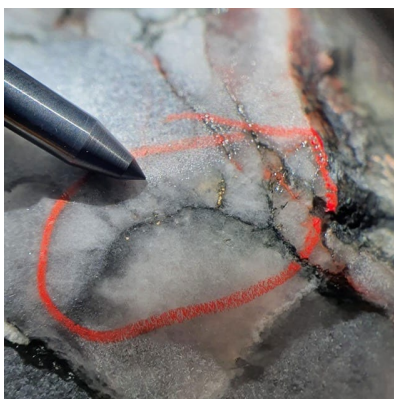
Example of visible gold in a drill core. Geologists often circle it as part of the recording process.