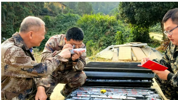
Technicians of Hunan Province Geological Disaster Survey and Monitoring Institute check rock samples at the Wangu gold field in Pingjiang County, central China's Hunan Province, 5 November 2024. Note marked gold on cores.

The Wangu goldfield is a critical mineral producing region located in Central China and produces approximately 10% of the world's gold production. Recently the Geological Survey of Hunan announced that a new significant deposit of gold has been identified in the region. A geologist and prospector for the Bureau is quoted as saying, "Many drilled rock cores showed visible gold." One ton of ore produced 138 grams of gold. Over 40 veins have been specifically identified with the potential to produce over 300 tonnes of gold. Surrounding and deeper regions promise additional prospects with high gold to material ratios. The bureau also estimated there's another 1,000-ton gold resource at the site at a depth of more than 3,000 meters. Estimates value the deposit at 85 billion USD at December 2024 prices.