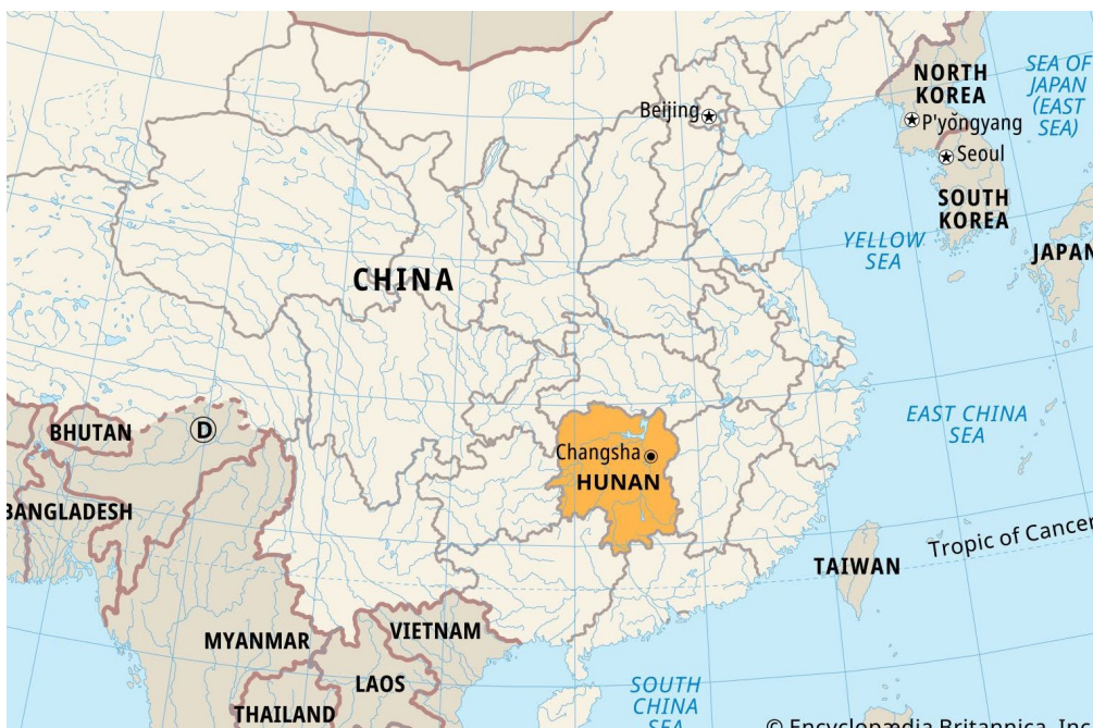
Wangu goldfield deposit in Hunan province could yield over 1,000 tonnes of precious metal.

desperate need of a local source of gold as the metal is in high demand in the industrial and computer chip production sector. Gold acts as a critical electric conductor in many modern electronic devices. As of 2023 China consumed almost three times as much gold as it produced. Heavy investment in mineral prospecting and developing large scale industrial mining has left a heavy toll on the landscape in the rush for natural resources. The deep depth of the deposit will require additional investment in deep mining technology. One deposit is recorded as 3,000 meters deep or 9,843 feet deep. For context, local Big Bear Lake is 6,759 feet above sea level.