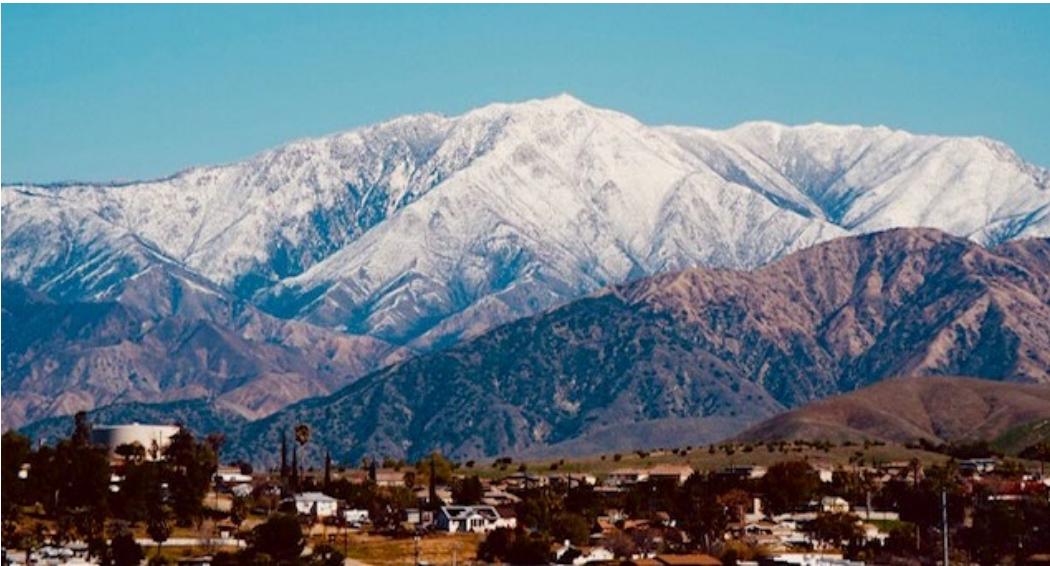
with a gorgeous view from the eastern Redlands area

The recent local storms left the local mountains crisp and white followed by bright springtime sunshine in early March. Weather predictions for the area.