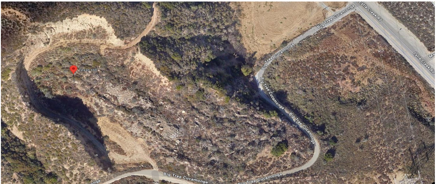
Texas Hill by Lytle Creek 2025 Satellite View by Google Maps

The deep cuts made to the landscape by hydraulic mining are starkly visible in this 1890's picture of an operation called Texas Hill in the Lytle Creek. It can still be seen in Google Maps aerial shots of the same area seen below. Many farmers and cattle ranchers also sought out the area for agriculture. One of the largest farming and ranch operations in the 1890's was called Glenn Ranch which was later made notorious for a family feud and gun fight that led to two more infamous murders. That, however, is another tall tale for around the camp