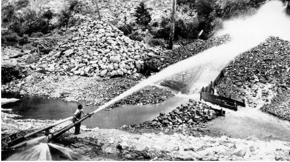
Hydraulic mining water cannon using high pressurized streams of water to process mass material that is then sent through sluices.

In December 1873, a well-respected 42-year-old miner from France was guiding his horse drawn buggy from the town of then Cucamonga (later ranch Cucamonga) just before sunset to his home and gold mine in the Lytle Creek area. The mine was well known to produce rich clean out regularly. One report said he made