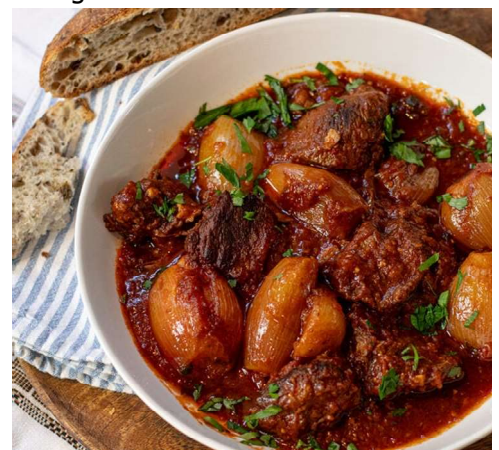
Greek Stifado Stew

Greek stew, aka Stifado, sourdough bread, Dutch Pea Soup, Italian Cioppino, a seafood stew popular in San Francisco, and fresh Salmon purchased from local indigenous peoples provided welcome changes to the bland diet of hard tack and dried meats most miners had in their carry sacks. Campfires of the Gold Rush became a literal epicurean melting pot of cultures and innovation as miners shared tastes of their hometowns with each other.