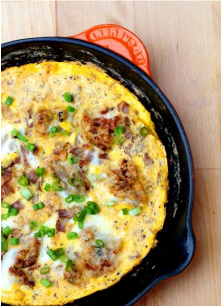
Modern Version of a Hangtown Fry

During California's Gold Rush (1848-1855), approximately 300,000 people from all over the world flocked to the region, each bringing their own culinary traditions. This cultural melting pot gave rise to a fascinating blend of international foods that helped shape California's diverse food culture.