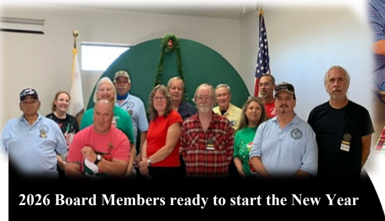
2026 Board Members ready to start the New Year